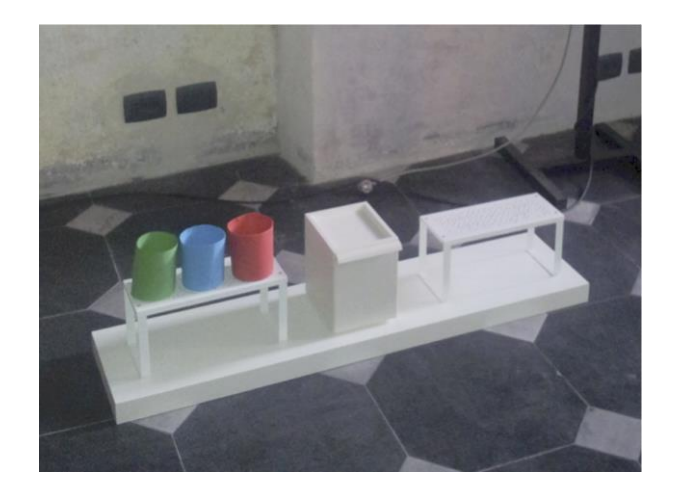
Figure 1. The Potter's set-up.

The working area , i.e., the area where the sound artisan carries out her work. This area consists of the personal space of the sound artisan herself. Moreover, the sound artisan requires an area where she can listen to a sound object. This is a table (the small table in the middle of Figure 1) in between draft and final areas.