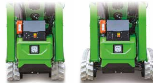
• Variable crawler gauge