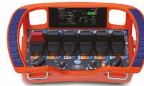
• Fully proportional wireless radio remote control