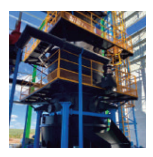
First Industrial scale gasification plant of olive pomace in the olive oil industry.