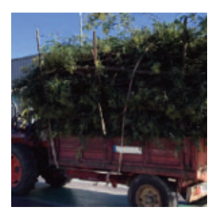
Forest debris from fire prevention recycled in a Portuguese Municipality.