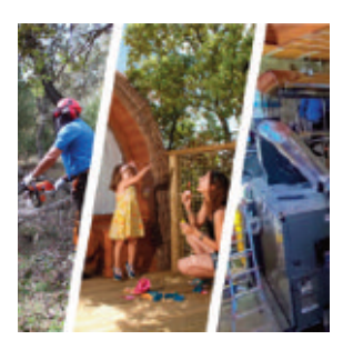
Forest silviculture for fire prevention in a tourist resort to feed its DH.