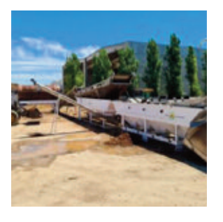
Mobile washing system for detaching soil and stones in woody biomass from prunings, uprroted tress and stumps.