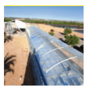
Integration of solar drying and gasification in the valorisation od sewage sludge at a full-scale pilot plant.