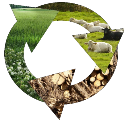
Logo of KiertoaSuomesta.fi platform

Video: www.youtube.com/watch?v=1V_XS650lxg